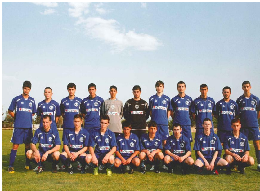
Picture 3. Football team “APOLLON” of ASPROPYRGOS, sponsored by VIORAL.

Within the size of the company actions are taken to the local society such as financial support to the local football club of Aspropyrgos so that a lot of young people can find a home to cover their needs many of those youngsters are VIORAL’s personnel boys and daughters